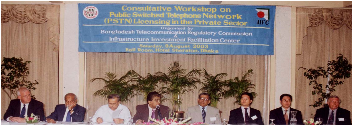
Workshop organized by BTRC and IIFC on PSTN Licensing in the Private Sector, held on 9 th August 2003 at Ball Room, Hotel Sheraton