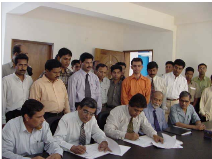
Signing of agreement between BTRC and IIFC in July 2002, the milestone that eventually led to the release of fixed telephony to private sector